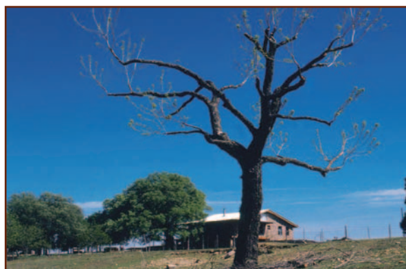
Figure 5. A native tree can be topworked (grafted) to an improved variety.