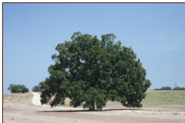
Figure 4. Isolated trees are vulnerable to birds and other nut eaters.