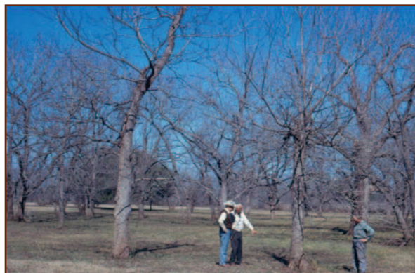
Figure 3. Weak trees should be removed early in the renovation process.

Grafted trees need more care than those not grafted. If you do not provide this care, the trees are better left as natives.