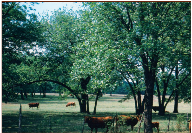
Figure 1. Grazing is an integral part of native pecan management; ideally, the animals should be removed 45 days before harvest.

When determining whether it would be economically feasible to improve your site, consider the soil depth, flooding potential, management options, pest control, and harvest requirements. A native pecan management program may include nut production as well as livestock grazing (Fig. 1) and recreational hunting.