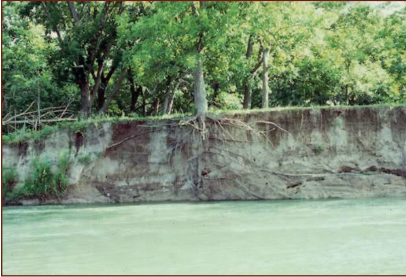
Figure 2. Deep soil is characteristic of native pecan bottoms.