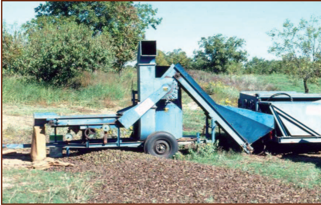
Figure 8. A pecan blower or vacuum separator removes foreign materials from the harvested nuts.

Cone and trunk traps can help you determine when to spray. For the weevil to lay its eggs, the pecans must be in the gel or dough stage. In the gel stage, the fill of the nut changes from water to gel. In the dough stage, the gel begins to solidify. Watch the nut development, and spray accordingly.