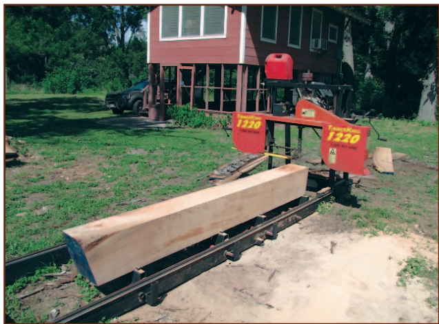
Figure 6. Small sawmills can be used to mill pecan logs into pecan lumber.

Before removing trees, contact potential buyers of firewood, saw logs, and/or veneer logs to determine if the trees could have monetary value after they are cut. In large native bottoms, you will need a trained forester to estimate the economic value and help find buyers.