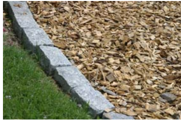
Curved stone pathway with wood mulch

Install edging to delineate between turf and bed areas. This will prevent St. Augustine and some Zoysias