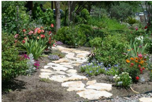
High maintenance plants, but great use of mulch

Mulching is easy to do and makes garden beds look better too. As I mentioned earlier landscape fabric can help deter weeds, but a good layer of mulch will work just fine and can be pulled back for planting, fertilizing, and reworking the soil if needed.