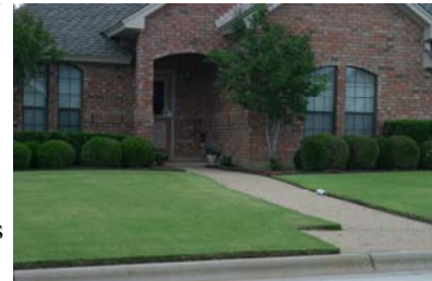
Angular corners make mowing difficult

Every extra foot of bed edge, rockwork and fence line can mean more weedeating or edging. Elaborate plantings with an extensive variety of plants need more attention to keep them tidy and attractive. Special