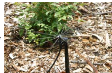
Microjet irrigation head

When possible install drip or micro sprinkler irrigation to shrub and flower beds. Drip applies water more efficiently and by not wetting the foliage may reduce some plant disease problems.